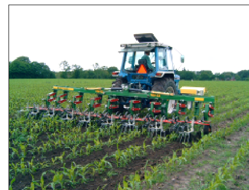
TRV in maize

The TRV interrow cultivator is made in a way so in principle it can be used in all row crops. Due to this the TRV can be adjusted in many different ways.